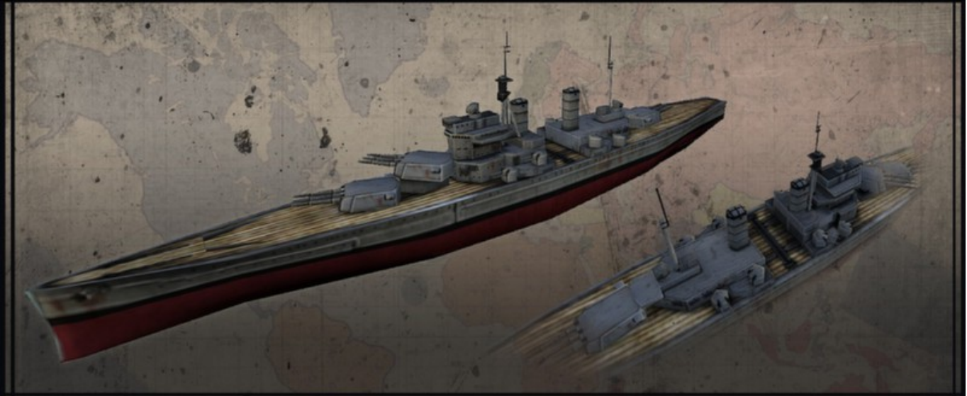
LION CLASS BATTLECRUISER

The Lion class were a class of battlecruisers built by the British Royal Navy before World War I. Nicknamed the "Splendid Cats", the ships were a significant improvement over their predecessors of the Indefatigable class in terms of speed, armament and armour. The Lion-class cruisers were 2 knots (3.7 km/h; 2.3 mph) faster, exchanged the 12-inch (306 mm) guns of the older ships for 13.5-inch (343 mm) guns, and had a waterline belt 9 inches (229 mm) thick versus the 6 inches (152 mm) of the Indefatigables.